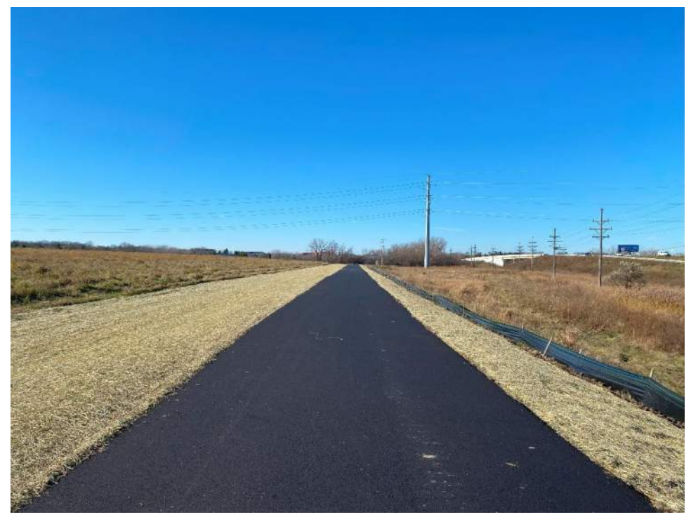
Photo No. 4 – North slope of Cell 1, looking west. Asphalt perimeter road was installed in 2024.