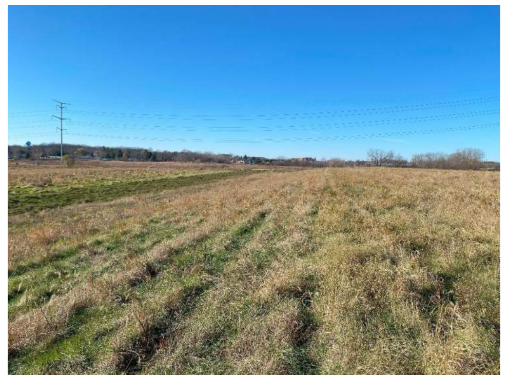
Photo No. 6 – South slope of Cell 1 and perimeter stormwater ditch, looking west.