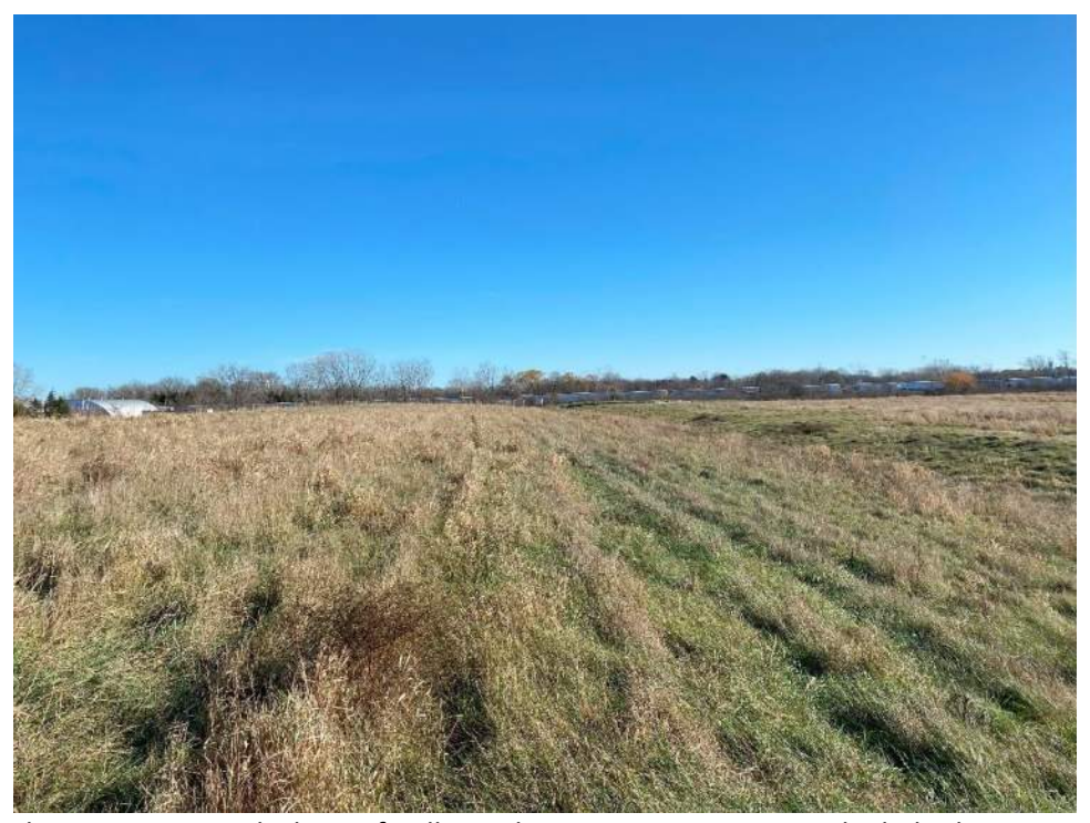
Photo No. 5 – South slope of Cell 1 and perimeter stormwater ditch, looking east.