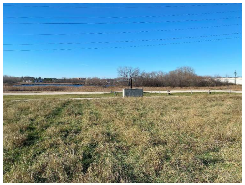
Photo No. 3 – Looking west from the Cell 1 cover at the leachate loadout pad.