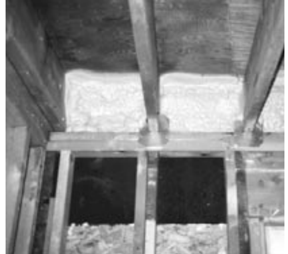
Insulating the sill box with spray-in foam.

Also, insulating a slab floor or foundation can help prevent heat loss, primarily along the edges where the walls meet the floor. Other areas that can be insulated include exposed heating ducts and water pipes.