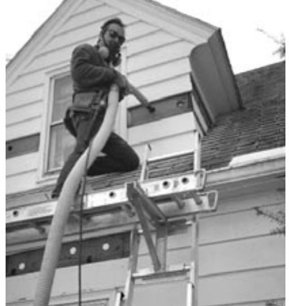
Installing blow-in insulation.

Keeping cold air from entering your home involves two tasks—sealing hidden building cavities and closing narrow spaces around windows and doors. Sealing hidden building cavities usually requires a professional blower door test to find the places that need sealing. A blower door is a panel-mounted fan that fits into an exterior doorframe. The fan pulls air out of the house, lowering the indoor air pressure and allowing outside air to leak in. Leaks often show up around plumbing penetrations, chimney chases, recessed light fixtures and dropped soffits (where kitchen cabinets are attached to the ceiling).